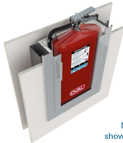
Model 10JABC shown installed in a fire-rated cabinet in a 3-5/8" studded wall